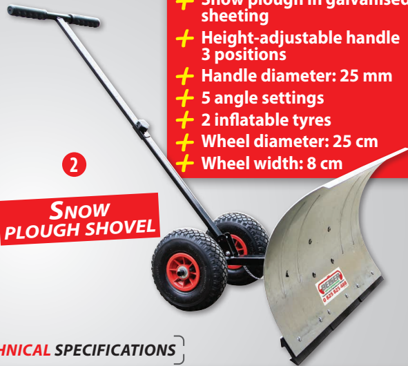
2 SNOW PLOUGH SHOVEL