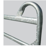
Strengthening: enhanced structural solidity (registered model)