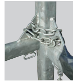
Secured by 2 chains for Texas barrier Ref. 03071000006