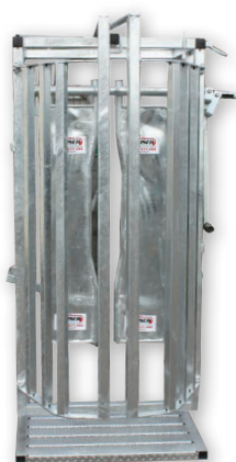
Front gate of the cattle chute or crate with restraint Ref.: 03070600029