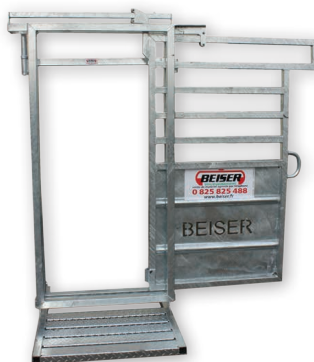
Back gate of the cattle chute or crate with side opening Ref.: 03070600032