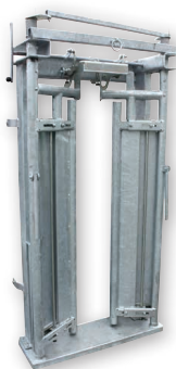
Self-locking front gate on the cattle chute or crate with central symmetrical crush, quick adjustment Ref.: 03070600021