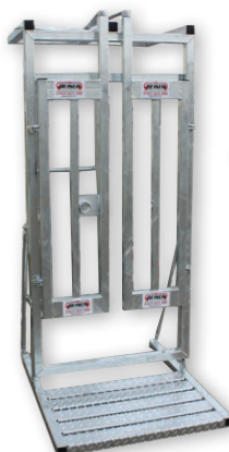
Double-leaf back gate of the cattle chute or crate Ref.: 03070600028