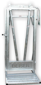
Standard front gate Ref.: 03070600031