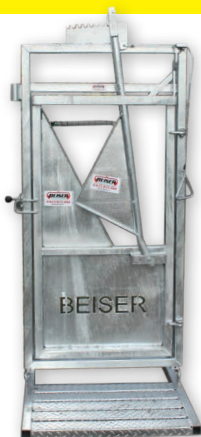
Front gate of the cattle chute or crate with feed front Ref.: 03070600030