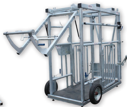
Back gate of the cattle chute or crate on jack, opens vertically Ref.: 03070600033