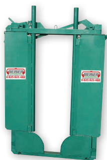
Front gate of the cattle chute or crate with progressive crush Ref.: 03070600023