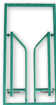
Back gate of the cattle chute or crate with back stop Ref.: 03070600026