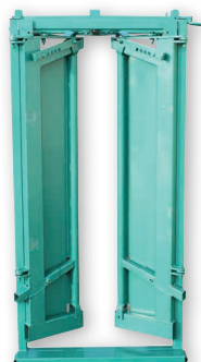
Self-locking front gate on the cattle chute or crate (for livestock without horns) Ref.: 03070600024