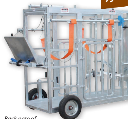
Back gate of the cattle chute or crate standard with pivoting opening Ref.: 03070600034