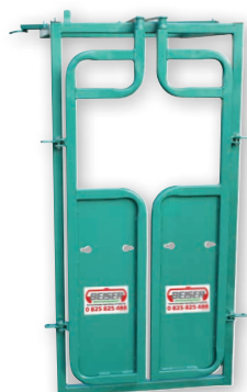
Double-leaf back gate for insemination Ref.: 03070600027